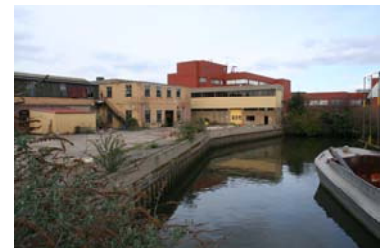
The River Brent