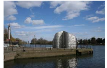
Connections between Brentford and Kew Gardens could be considerably improved through the re-introduction of the Brentford Ferry