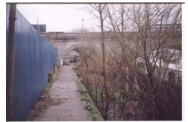
The Hollows forms part of the Thames Path. The area needs to be upgraded and the alternative land-side route legibly waymarked