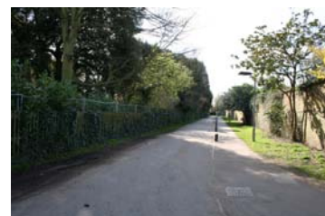
Potential route of the Thames Path through Syon Estate

Accessibility along the Thames Path could be improved. It is envisaged that this would be a long term proposal however, due to the nature of the footpath and the many changes in level along the route that would need to be overcome. In the short term it is proposed to waymark a legible alternate route along the High Street between Kew Bridge and Waterman's Park with associated landscaping enhancements such as surface works, signage, streetscape improvements and tree planting. Links to the Kew Bridge Steam Museum to be enhanced and to any enhancements (TfL) to the connection with Kew Bridge Station.