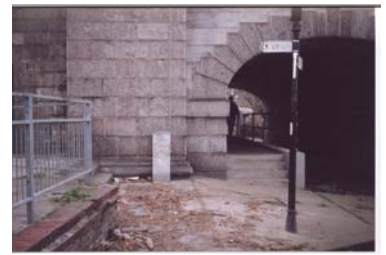
Connections under Kew Bridge should be enhanced

Brentford’s position on the north bank of the Thames allows for fabulous south facing views across the river. These spaces should be enhanced – particularly at Waterman’s Park, Ferry Quay and along the River Brent. De-cluttering the streetscape of unnecessary and redundant street furniture and signage whilst retaining those elements that help to navigate the user through the areas multi-layered past – mental mapping is an important consideration. Ways to make these open spaces safer through enhanced lighting, diversity of use and design should be incorporated into the design. Improve and