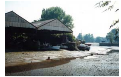
Brentford has the potential to form a major centre for small-scale water based industrial activity

The proposition for a waterspace employment cluster can be justified through the strategic planning framework and the character assessment of the area. Both the Mayor’s Plan for London and the Brentford Area Action Plan make reference to the strategic importance of Brentford’s boating industry. A waterspace employment cluster would help to achieve the goals of both plans in particular the Mayor’s Plan for London policy 4.114. At the local level, the TLS and the Brentford Area Action Plan make considerable reference to the area’s unique position as London’s gateway to the UK’s canal network from the Thames that has survived as a hub of water based industry. It is this industry that gives Brentford much of its character and distinctiveness that should be protected and enhanced. Much of Brentford falls within the area at risk from flooding and many of the boat repair yards are situated in places that are subject to the rise and fall of daily tidal fluctuations. Traditional boatyards are ideally suited to this environment utilising the tidal river as an intrinsic part of the day-to-day operation of their industry making them an ideal use for waterside locations that actively makes space for water.