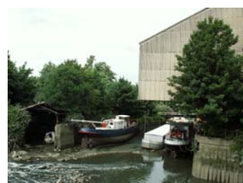
Different aspects of the River Brent at its junction with the Thames