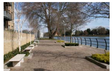
The Thames Path at Ferry Quays has been much improved and opened up in recent years