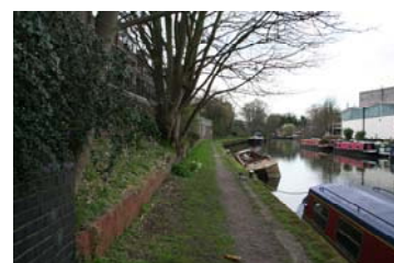
The glorious Grand Union Canal between Bretford Bridge and Thames Lock

It is proposed to improve the entrances into the park and the connections between the riverside amenity and the Green Dragon Estate. Much good work has been carried out recently to improve the visual appearance of the south facing garden. This should be continued to include new benches and planting to encourage more families to use the open space and the riverside playgrounds.