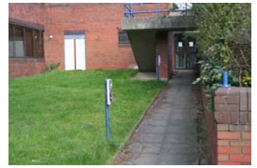
Connections between Waterman’s Arts Centre and the Thames Path towards Ferry Quays need to be made legible and welcoming

Restoration of Brentford’s Waterspace, the Thames Path and riverside open spaces would make an attractive environment for local people to use, enjoy and be proud of, whilst adding considerably to the tourist potential that the town has to offer. Brentford has the potential to be a major destination point in its own right as well as a place