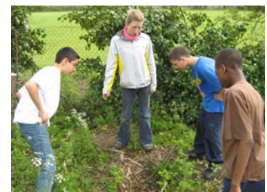
Education and community involvement will be key to the project’s success

The potential to enhance the visitor experience along Brentford’s Waterspace is considerable –particularly linked to the regeneration of the land south of the High Street and to the working canal junction. Brentford’s position next to Syon House and within the buffer zone of the Kew World Heritage Site could be exploited through the provision of a footbridge or ferry to attract visitors to the area to experience a watery world that has almost been lost elsewhere in the capital. In addition, canal boats from across the UK could stop at new moorings to visit one of the nearby attractions adding to the