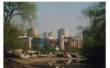
Waterman’s Park from the river