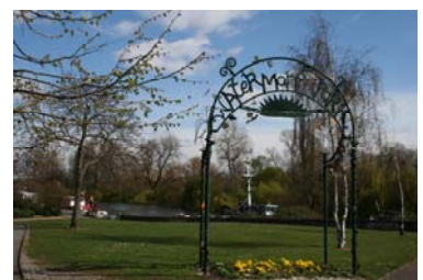
Waterman’s Park entrance