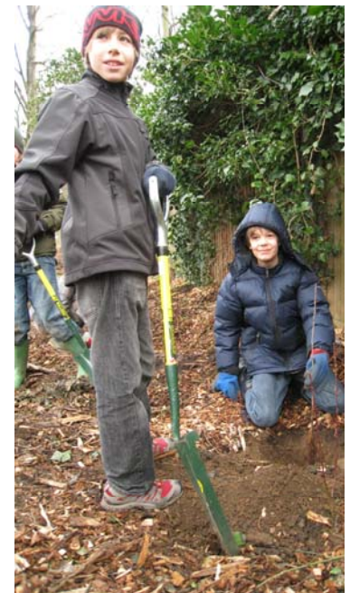
All TLS projects incorporate volunteering

A funding bid has been submitted to Natural England’s Access to Nature Fund that makes considerable reference to Brentford as a key priority for new TLS educational initiatives. It is proposed to work with existing groups and structures in order to build inclusion and ownership of the riverside by a number of key audiences. An important element of this plan is to link educational programmes with project work on the ground and volunteering opportunities.